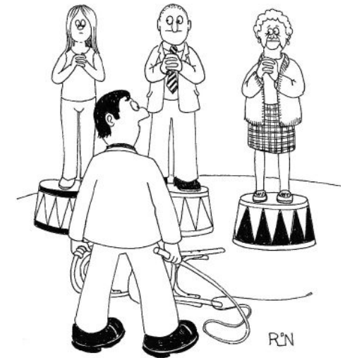
The Lay Training Programme was the envy of the diocese

I put Granma on speed dial - I call that Instagram.