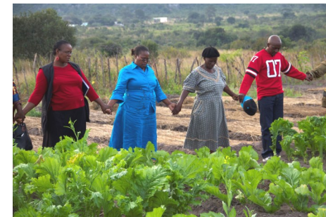
Church and Community Mobilisation process Zimbabwe

We are a Christian mission organisation with an aim to show our Christian faith by the transformation of communities worldwide.