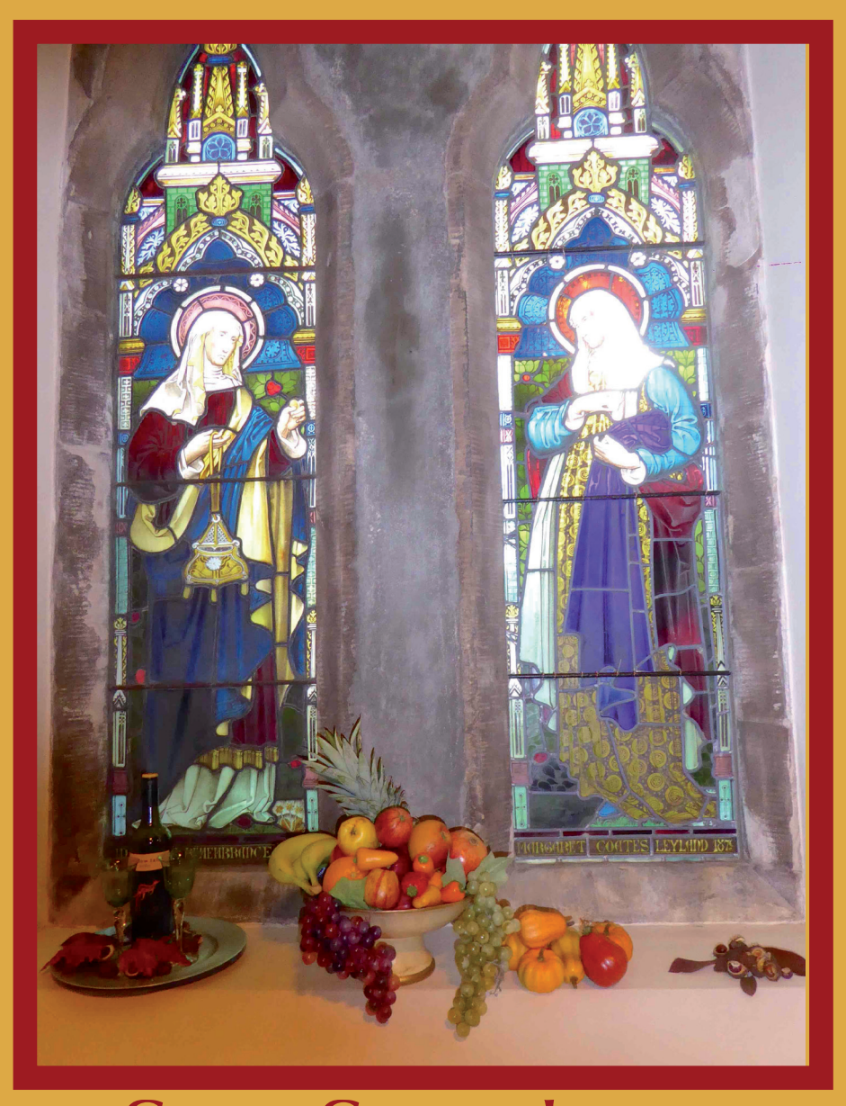
CHRIST CHURCH LANARK CLYDESDALE'S EPISCOPAL CHURCH SEPTEMBER - OCTOBER 2018