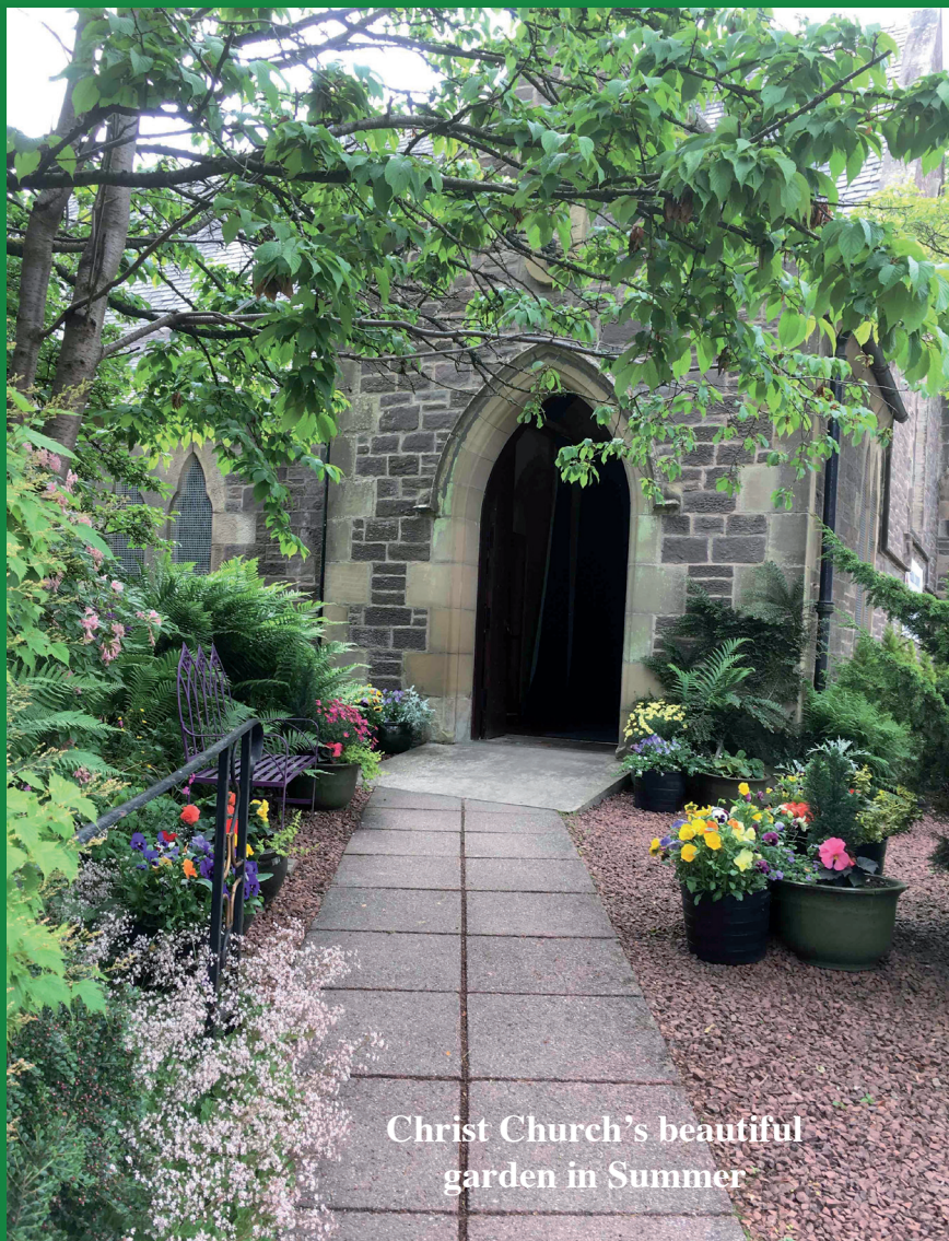
Christ Church's beautiful garden in Summer

CHRIST CHURCH LANARK CLYDESDALE'S EPISCOPAL CHURCH JULY - AUGUST 2018