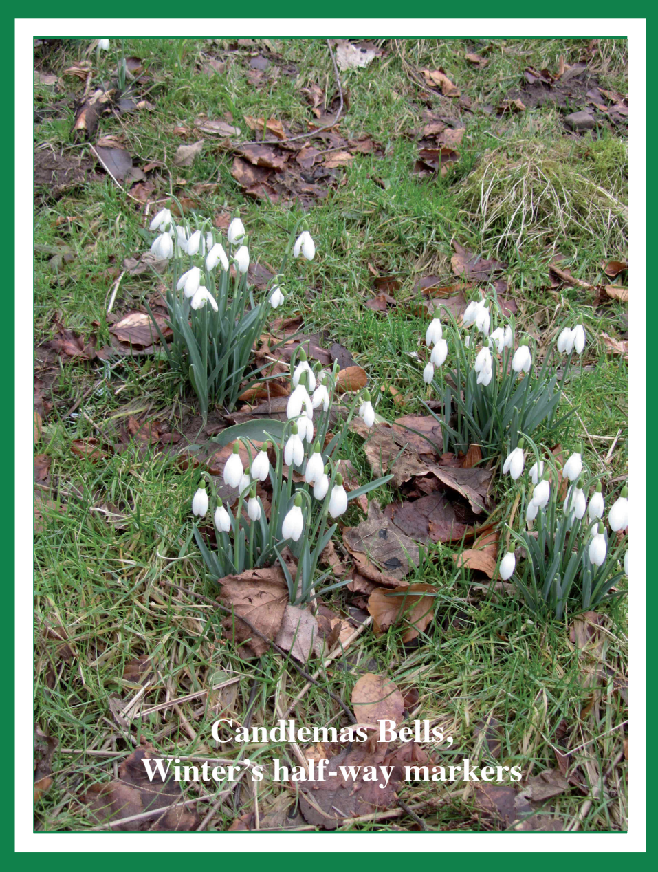
CHRIST CHURCH LANARK FEBRUARY - MARCH 2017