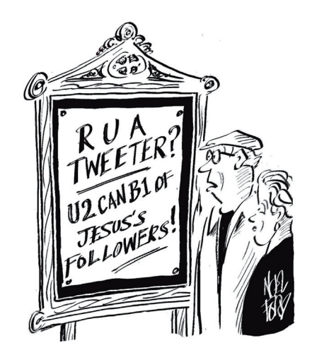
"To think we grumbled when the Church used unintelligible archaic language"

Tell your wife that she looks pretty, even if she looks like a truck. - Ricky, age 10